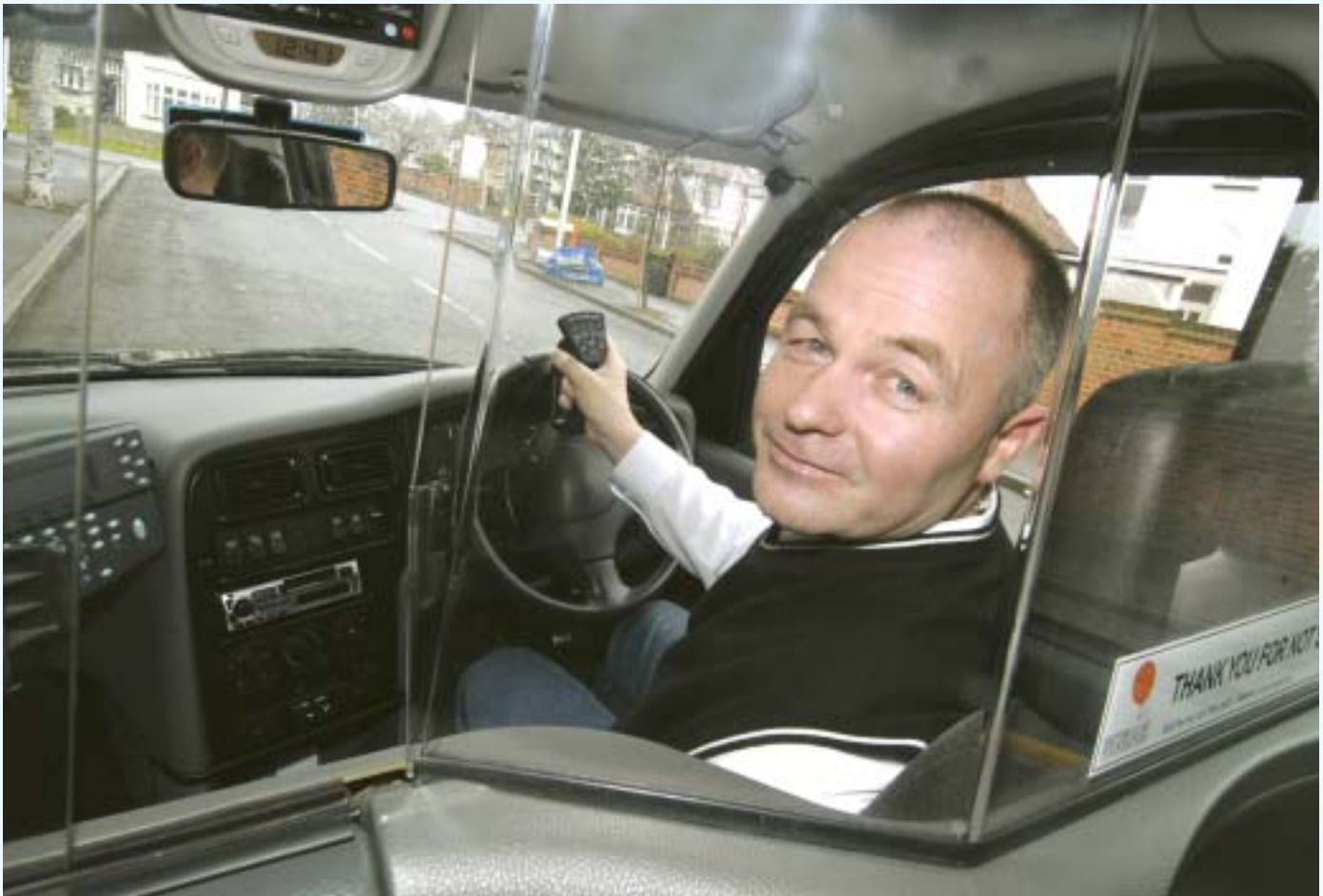
DISABILITY RIGHTS COMMISSION

The possible pitfalls of undertaking an audit were illustrated in a Warwick University survey, which found that two different surveys of the same private sector employer showed 2.1 and 6 per cent of the workforce declaring a disability. Disparities of this size could be down to a